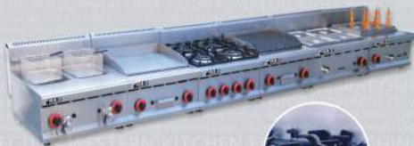
台式燃气组合炉 Counter top gas combination oven