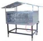
燃气烤全羊(电炉) Gas cover roasted whole pig 型号(Model): GS-260K 规格(Size): 2000 × 1600 × 1800mm 电压(Voltage): 220V