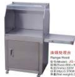
排烟处理箱 Flange Hood 型号(Model): JG-600 规格(Size): 600 × 900 × 1000mm 功率(Power): 220W 功率(Power): 0.37kW 净重(Net weight): 30kg