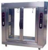
燃气立式旋转双头烤全羊炉 Vertical 2-Food Gas Shawarma Broiler Roasted whole sheep 型号(Model): GS-200-2 规格(Size): 1400 × 620 × 1700mm 电压(Voltage): 220V 功率(Pwr): 5.5kW 特点: 燃气以外能放炭烤, 自动温控系统