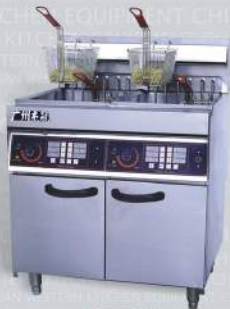
立式双缸煎锅电炸炉 Electric 2-Food Fryer (EF-202) (Pressurizing Type) 型号(Model): EF-202 规格(Size): 800 × 800 × 1800mm 电压(Voltage): 240-260V 功率(Pwr): 3.9kW 容量(Capacity): 25L 净重(Net weight): 45 kg 特点: 立式, 可叠放, 有六通定时器系统