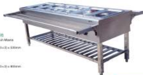
立式可拆卸式电热汤池 Vertical Removable Bain-Marie 型号(Model): E-B-12 规格(Size): 2000 × 720 × 180 (180 × 2) × 500mm 电压(Voltage): 220V 功率(Power): 4kW 1/2 × 6" × 18" 型号(Model): E-B-13 规格(Size): 1400 × 720 × 180 (180 × 2) × 800mm 电压(Voltage): 220V 功率(Power): 4kW 1/2 × 6" × 8"