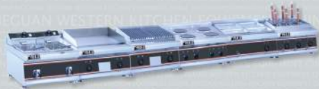
台式电组合炉 Combination oven