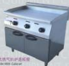
立式燃气扒炉带柜 Griddle With Cabinet 型号(Model): G-144 规格(Size): 800×680×800mm 额定功率(P): 13.5kW 净重(Net weight):