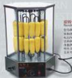
旋转式烤玉米机 Rotative type maize corn machine 型号(Model): CD-10-2 规格(Size): 442 × 300 × 720mm 电压(Voltage): 220V 功率(Power): 600W 净重(Net weight): 20kg 特性: 四面高温烤化迅速 玉米可自转和公转, 52只/次